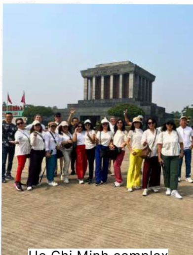
Ho Chi Minh complex

Distance Hanoi – Halong: 165km => 4 hours transfer including break time on the way