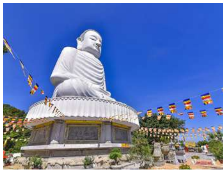
Linh Ung Pagoda