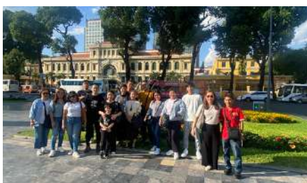
Centre Post Office