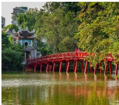
Hoan Kiem lake