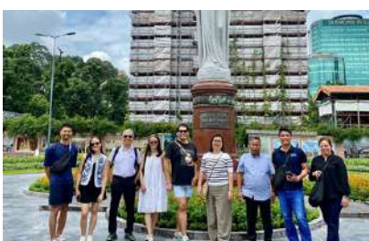
Cathedral of Notre Dame

Half city tour: located in Dist 1 and takes 2 – 3 hours to cover all destinations