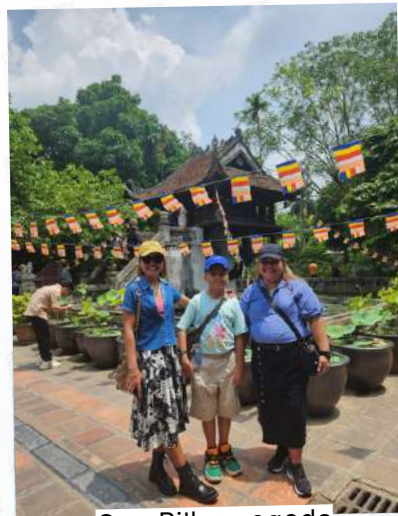
One Pillar pagoda