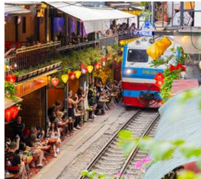
Hanoi Train Street Coffee