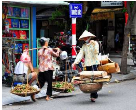
Hanoi Old Quarter