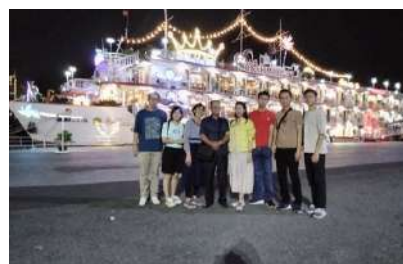
Dinner on Saigon Cruise